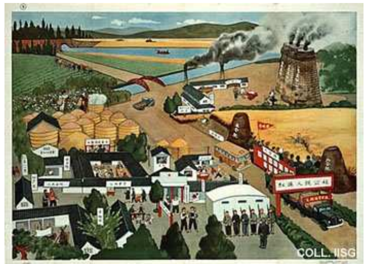
This propaganda poster shows the embodiment of the Great Leap Forward: “The people’s commune” – the new ideal communistic village.